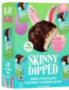
Skinny Dipped Coconut almond bites