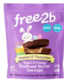
Free2b Sunflower butter cups