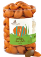
Lake Champlain chocolate eggs