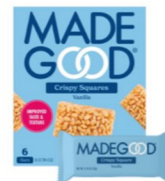
Made Good Crispy squares