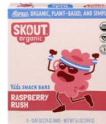
Skout bars Code: homeswaps