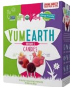
Yum Earth Variety candies