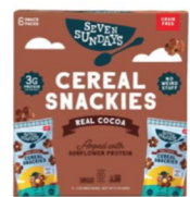
Seven Sundays Cereal snackies